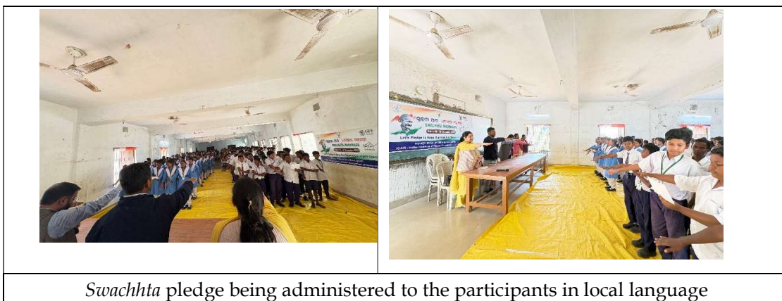
Swachhta pledge being administered to the participants in local language

Some of the action and activity photographs of Day-2 (17.12.2025) are presented below.